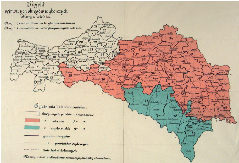
Draft of the parliamentary electoral constituencies in 1900 10

called themselves “stanchykers” – the name comes from the so-called Stańczyk portfolio – a collection of letters condemning any rebel outbursts. Their motto and essence was a return to the Emperor Francis Joseph I from 1866: “With you, Your Majesty, we stand and want to stand”. The main leaders of this group were Paweł Popiel and Stanisław Tarnowski. On the eve of World War I, when all political parties had to decide about the orientation in relation to the future international conflict, conciliators sided with the so-called concept of building triple Monarchy (Austro-Hungarian-Polish).