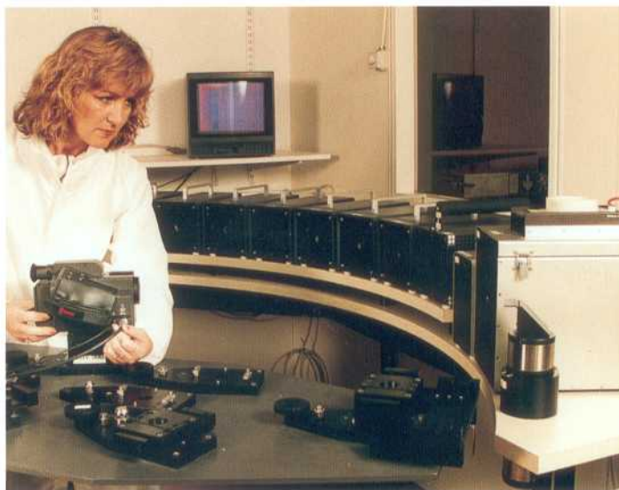
Calibration room. All cameras are individually calibrated.

AGEMA's global network of representatives and agents provide custom-made solutions, training and service.