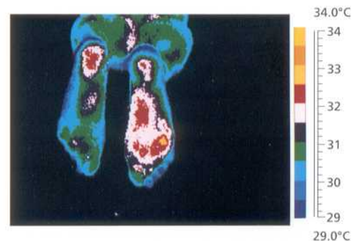
Indication of "Insensitive Feet" disease – right foot.

that is, synovitis of joints and tendon sheaths, epicondylitis, capsular and muscle injuries, etc. However, both "hot and cold responses" may co-exist if the pain associated with an inflammatory focus excites a somato sympathetic response. Also, vascular conditions are readily demonstrated by IRT, such as Raynaud's, vasculitis, limb ischemia and migraine.