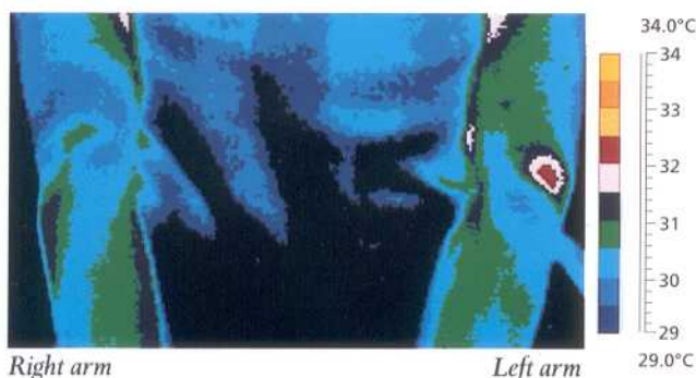
Indication of epicondylitis left arm.

From the removable PC card the images are transferred to a computer from which they can be retrieved and analysed, printed or just kept as a record.