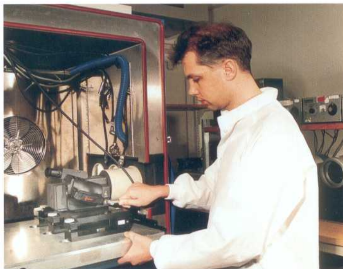
Climatic chamber. Control of measurement stability.