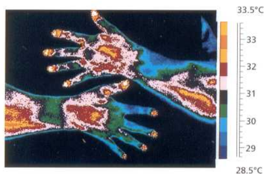
The image shows lower blood circulation in the four fingers of the right hand.